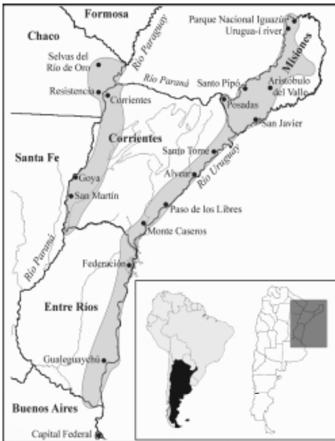
Figure 1. Map of Argentina with detail of main rivers and cities in northeastern Argentina (NEA). Sampling areas in gray.

Between 10 and 26 July 2000, 26 stations were surveyed on the right margin of low Paraguay River, Chaco province, and on the left margin of the Paraná riverbed, Corrientes. Besides, between 11 and 25 September 2002, 40 stations belonging to the Basin of Uruguay River, in Argentinian territory from Entre Ríos to Misiones) and in the Paraná River and their tributaries from Puerto Iguazú to Posadas, Misiones (Fig. 1 and Table 2) were surveyed. Samplings were carried out on the basis of a previous revision of